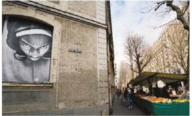
JR French, born 1983, 28mm, Portrait of a generation (2004) Byron @JR-ART.NET