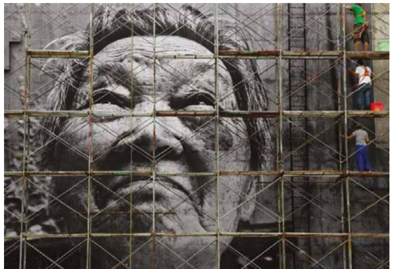
JR French, born 1983, Action in Shanghai, Shi li work in progress, China, 2010@JR-ART.NET