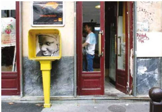
JR born, French 1983, 28mm, Portrait of a generation (2004) Araba @JR-ART.NET